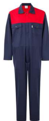
NAVY BLUE - RED

KARDELEN İS ELBİSELERİ & İSG DONANIMLARI