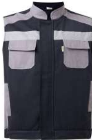
NAVY BLUE - GRAY