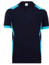
NAVY BLUE- TURQUOISE

KARDELEN İS ELBİSELERİ & İSG DONANIMLARI