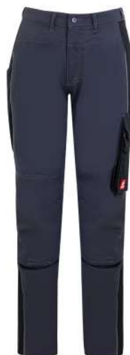
D.GRAY - BLACK