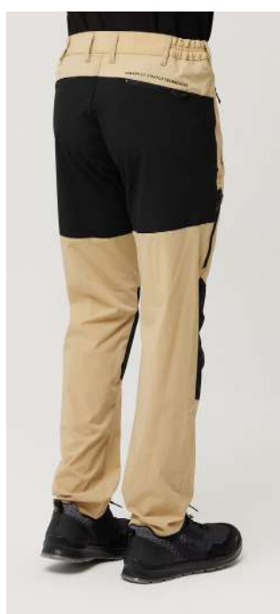
SAHRA - OLTU