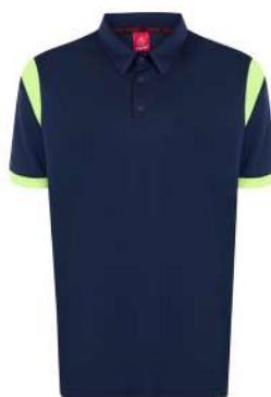
N.BLUE- NEON YELLOW