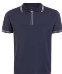
ANTHRACITE - GRAY