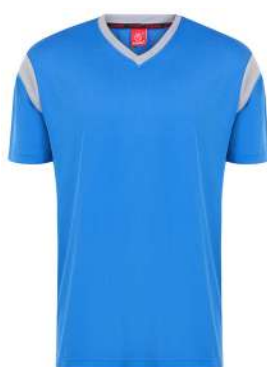
BLUE - GRAY