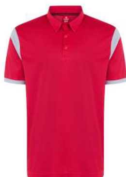
RED - GRAY

Ultra-light, breathable, and wrinkle-resistant — designed with Dry Touch fabric for lasting comfort. Crafted with innovative Dry Touch fabric, this polyester-based polo shirt offers a uniquely soft feel, exceptional breathability, and a wrinkle-free, no-curl finish — perfect for all-day performance and style.