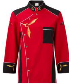
RED- BLACK - WHITE

KARDELEN® İS ELBİSELERİ & İSG DONANIMLARI