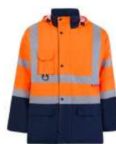
P.ORANGE - NAVY BLUE