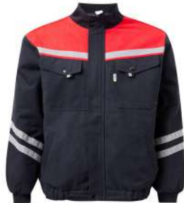
NAVY BLUE - RED