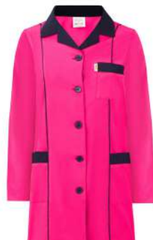
FUCHSIA - NAVY BLUE

KARDELEN İS ELBİSELERİ & İSG DONANIMLARI