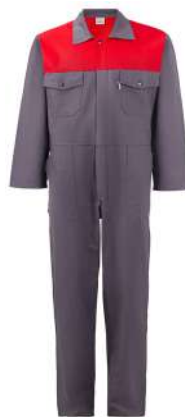
GRAY - RED