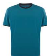
PETROL BLUE- BLACK