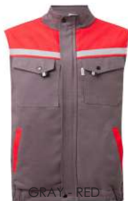
GRAY - RED