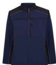
NAVY BLUE - BLACK