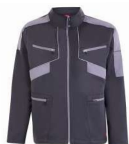
ANTHRACITE - L.GRAY