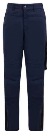
NAVY BLUE - BLACK