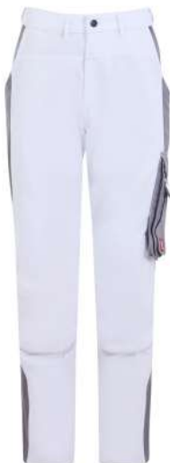
WHITE - GRAY