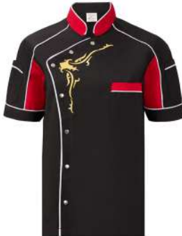
BLACK - RED - WHITE

KARDELEN® İS ELBİSELERİ & İSG DONANIMLARI