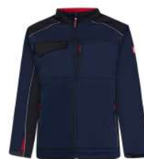
NAVY BLUE - BLACK