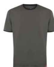
KHAKI - BLACK