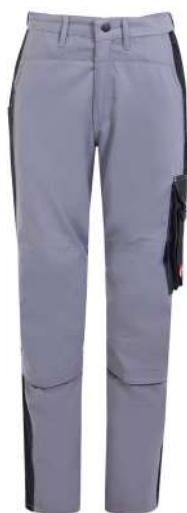
GRAY - BLACK

These work pants are designed to deliver maximum comfort and efficiency in demanding work environments, featuring a durable structure and functional details. The self-elastic waistband ensures a comfortable fit and adaptability throughout the day.