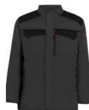
ANTHRASITE - BLACK