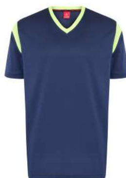
N.BLUE - N.YELLOW