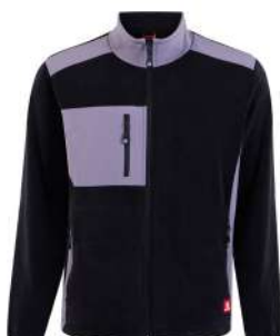
BLACK - GRAY