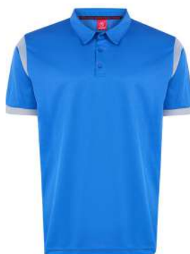
BLUE - GRAY