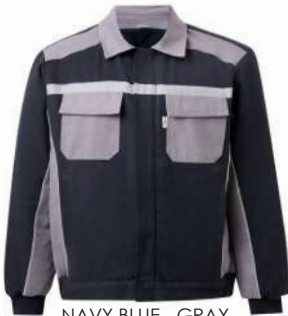
NAVY BLUE - GRAY