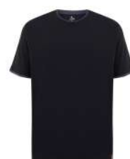
BLACK - GRAY