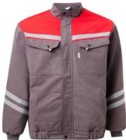
GRAY - RED