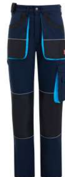
NAVY BLUE - BLACK - TURQUOISE