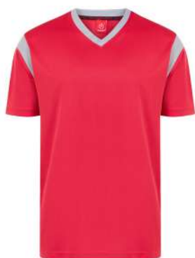
RED - GRAY

Ultra-light, breathable, and wrinkle-resistant — designed with Dry Touch fabric for lasting comfort. Crafted with innovative Dry Touch fabric, this polyester-based polo shirt offers a uniquely soft feel, exceptional breathability, and a wrinkle-free, no-curl finish — perfect for all-day performance and style.