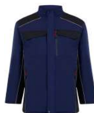
NAVY BLUE - BLACK