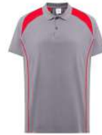
GRAY - RED