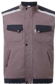
GRAY - NAVY BLUE