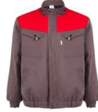
GRAY - RED

KARDELEN İS ELBİSELERİ & İSG DONANIMLARI