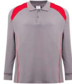
GRAY - RED

KARDELEN İS ELBİSELERİ & İSG DONANIMLARI