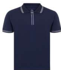
NAVY BLUE - GRAY