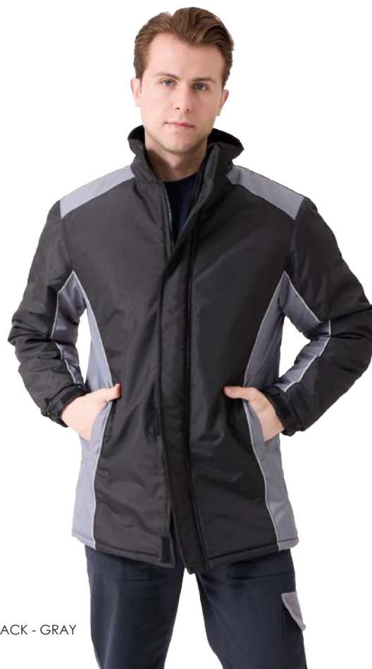
BLACK - GRAY