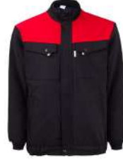
NAVY BLUE - RED