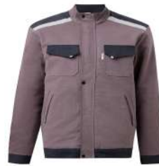
GRAY - NAVY BLUE