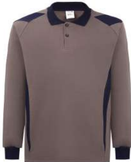
D.GRAY - NAVY BLUE