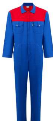
SAX BLUE - RED