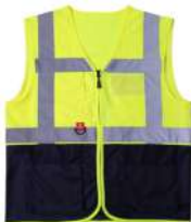
P.YELLOW - NAVY BLUE