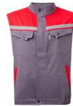
GRAY - RED

KARDELEN İS ELBİSELERİ & İSG DONANIMLARI