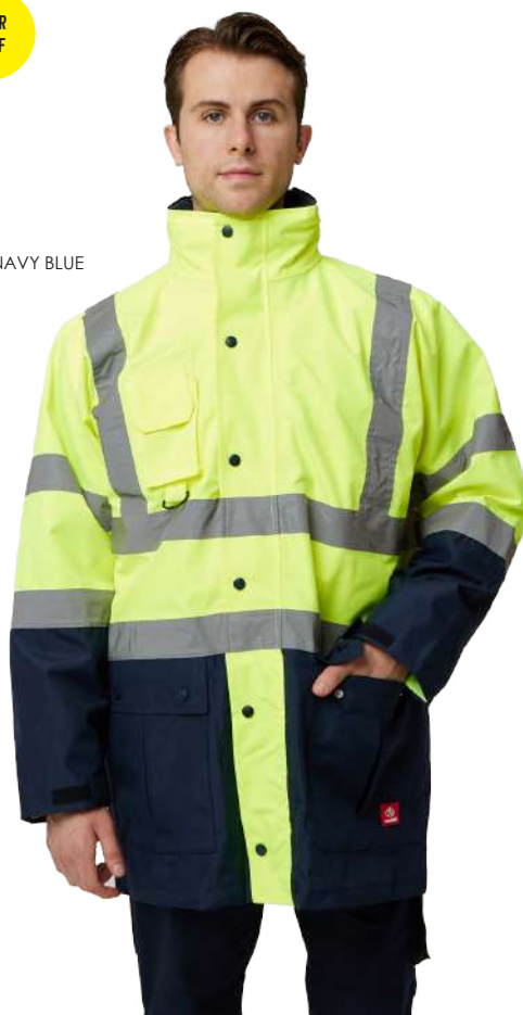
P.YELLOW - NAVY BLUE