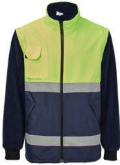
P. YELLOW - NAVY BLUE