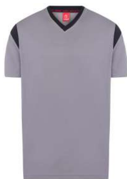
BLACK - GRAY