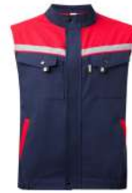
NAVY BLUE - RED