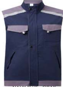
NAVY BLUE - GRAY