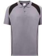
GRAY - BLACK