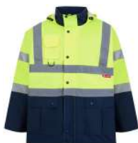
P.YELLOW - NAVY BLUE