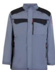
GRAY - BLACK