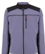
GRAY - BLACK