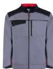
GRAY - BLACK