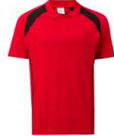
RED - BLACK

KARDELEN® İS ELBİSELERİ & İSG DONANIMLARI