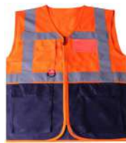
P.ORANGE - NAVY BLUE