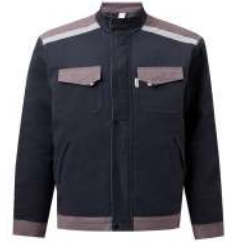
NAVY BLUE - GRAY

KARDELEN İS ELBİSELERİ & İSG DÖNANIMLARI