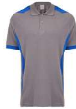
GRAY - SAX BLUE