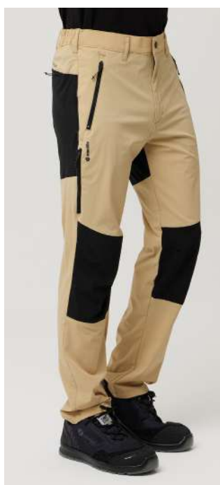
A.VÍZON - OLTU

Water-repellent, breathable, and flexible — built for all-day outdoor comfort. Crafted from a breathable, water-repellent, and stretchable fabric, this outdoor pant offers exceptional comfort, moisture control, and freedom of movement — making it a perfect choice for high-performance and everyday wear.